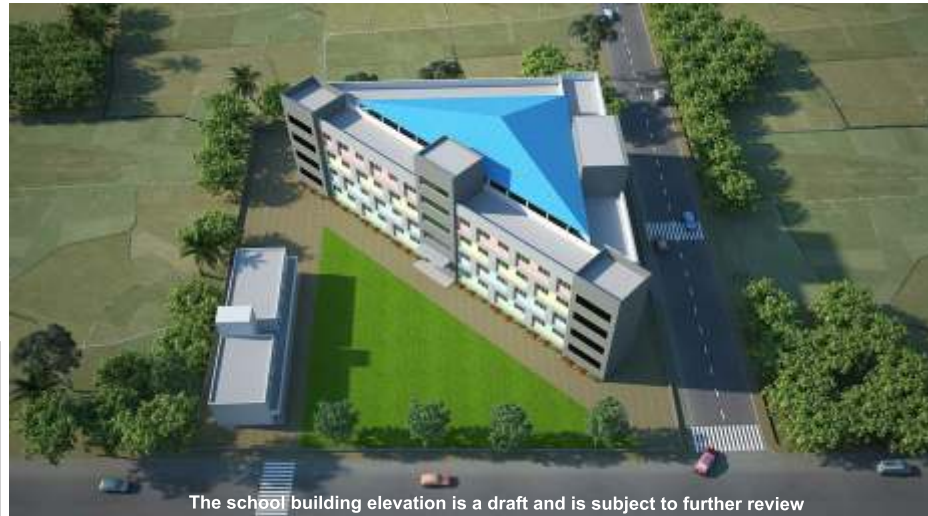
The school building elevation is a draft and is subject to further review

Make a difference Now, That Lasts for Generations