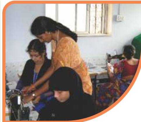
Tailoring class at Dharavi