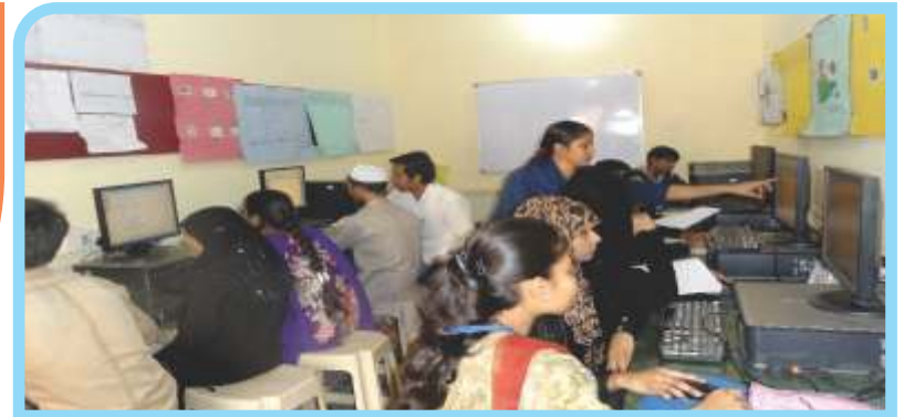
Information Technology Class