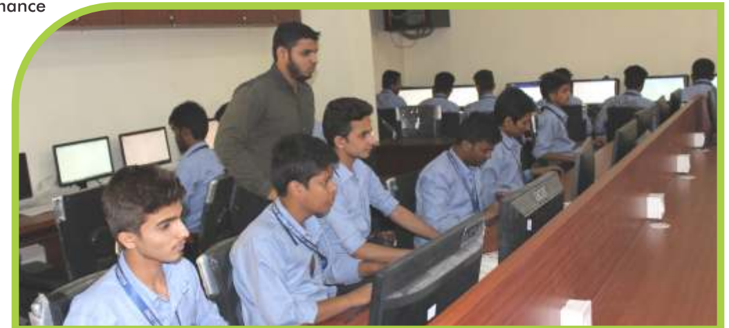
Jr. College Information Technology Laboratory