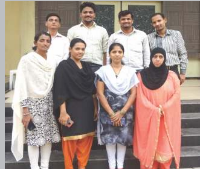
Vocational Training Centres' Staff