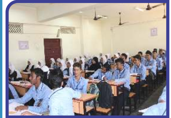
Jr. College Class