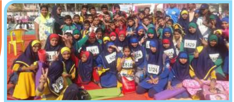
Our students at Thane Mayor Marathon