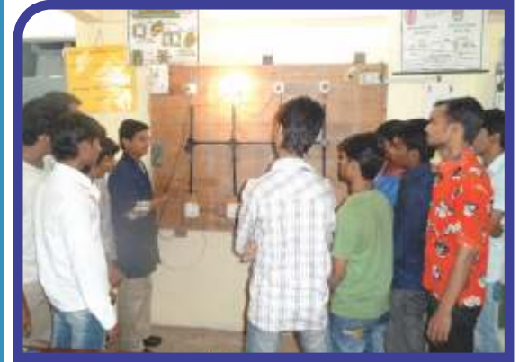
Students at the practical session