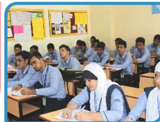
Junior College in session