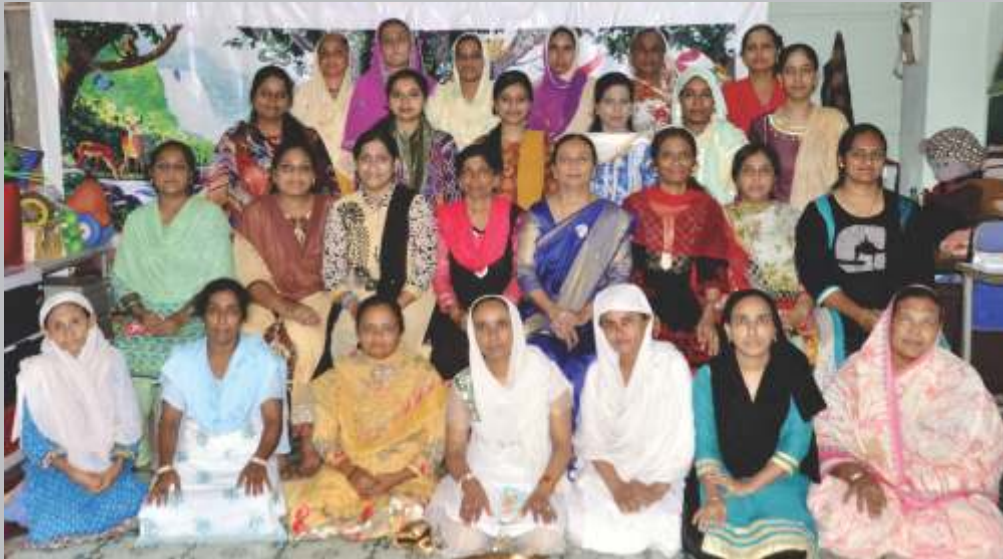
Angels' Paradise Nursery Schools' Staff