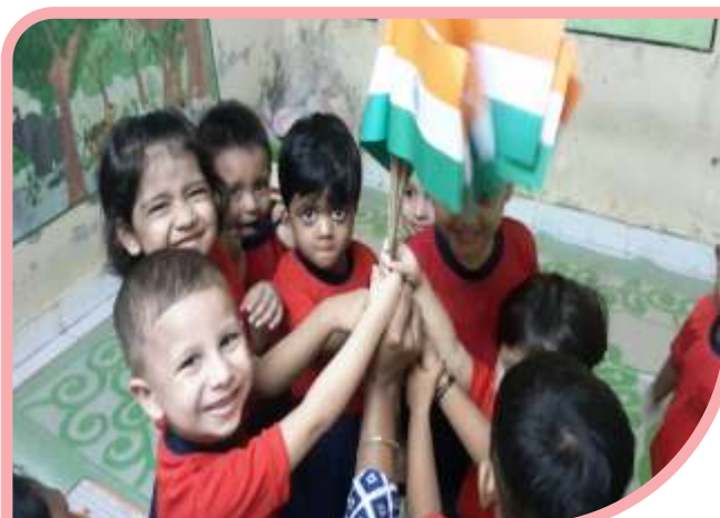
Tiny Tots celebrating Independence Day in one of our Nursery Schools