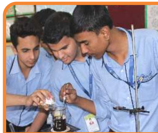
Jr. College students at Science Practical