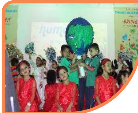
Annual Day Performance