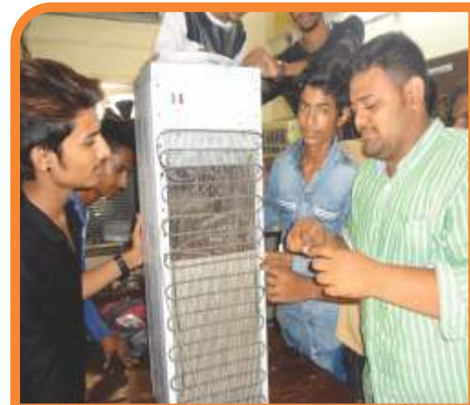
AC & Refrigeration students during practical exam