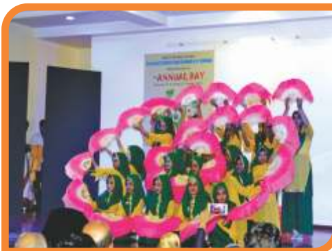
A memorable performance of our Crescent School students