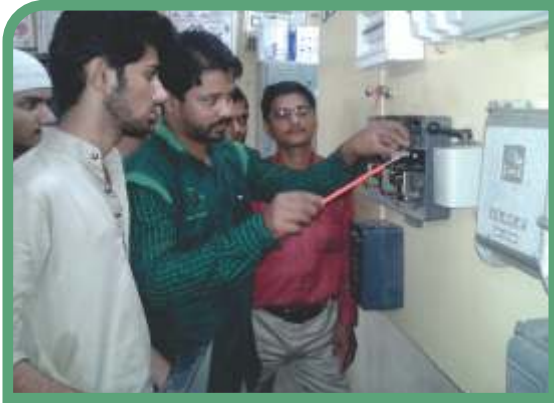
Electrician students during practical exam