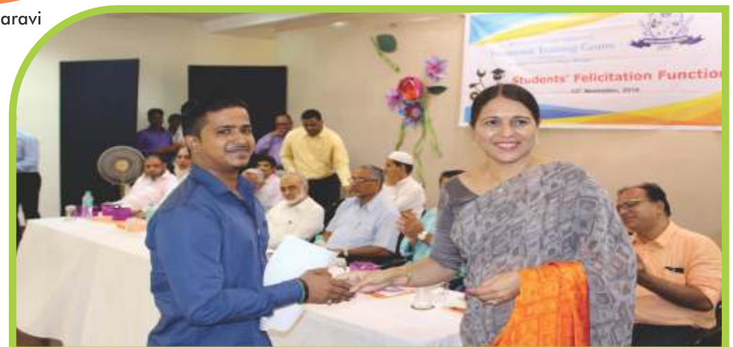
Felicitation Function of Vocational Training students