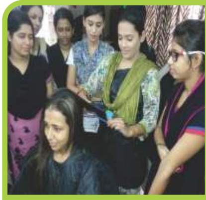
Beautician course practical session