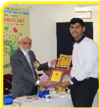
Felicitation of S.S.C. Topper