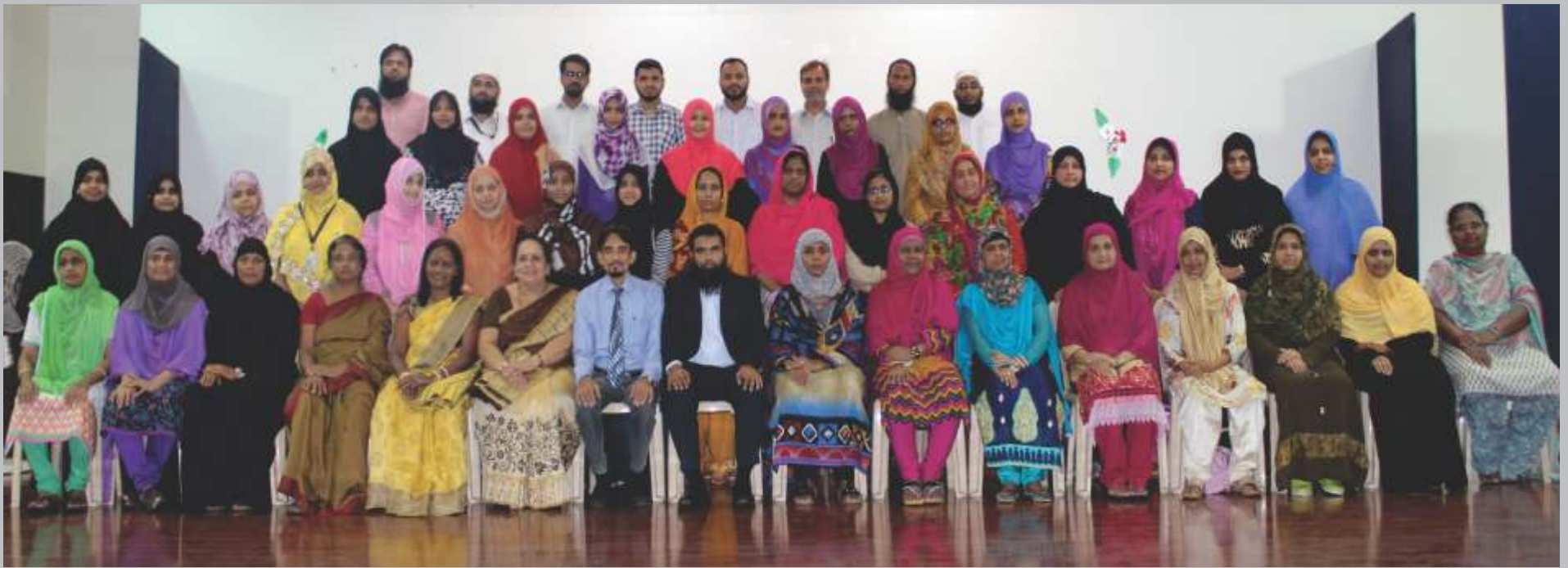
Crescent English High School & Junior College Staff