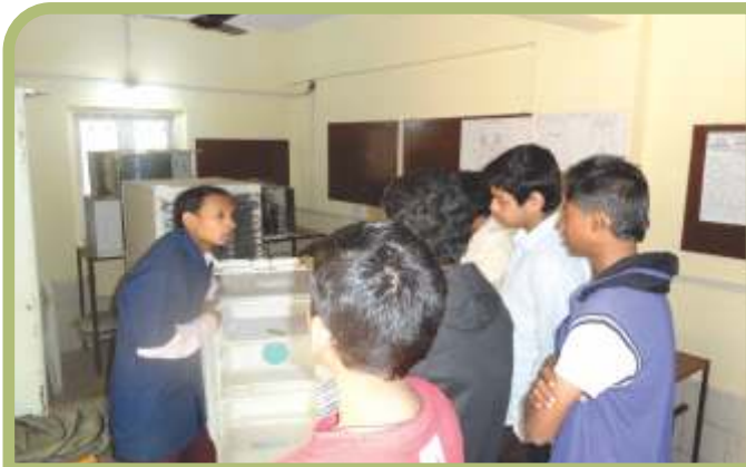
AC & Refrigeration students getting practical knowledge