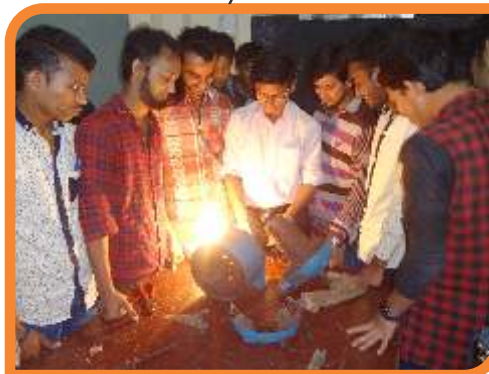
Electrician students during the practical session at our Vocational Training Centre