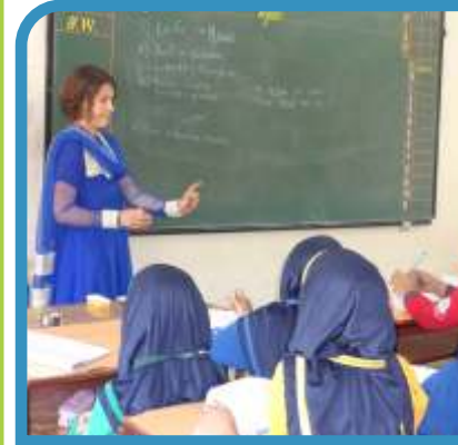
A Volunteer from U.S.A. taking spoken English classes