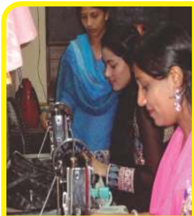
Tailoring class at Mumbra