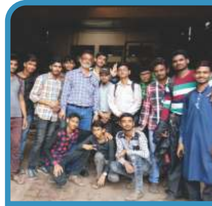
Students Industrial visit