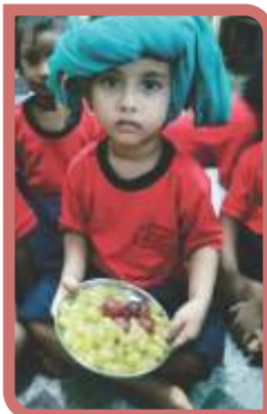
Activity Based Learning in our Nursery Schools